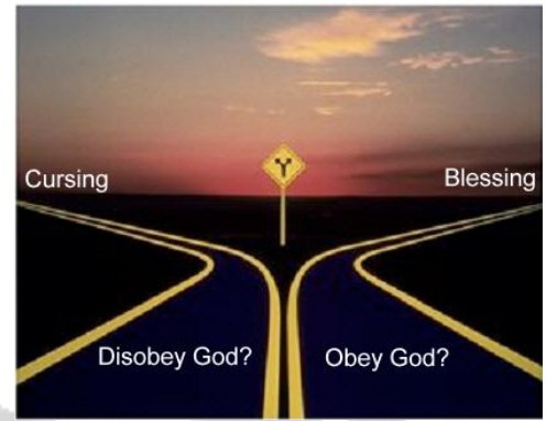
Israel at Kadesh-Barnea