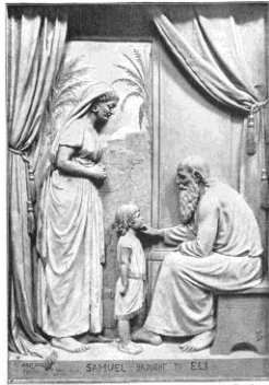
Hannah presenting Samuel to Eli

Possibly Samuel, but also includes writings from the prophets Nathan and Gad (1 Chronicles 29:29)