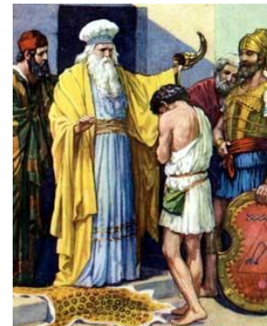
David Anointed King